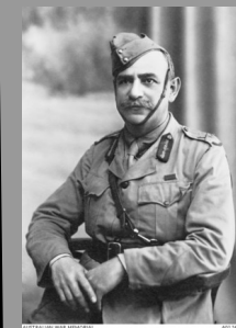
Sir John Monash

« Adopt as your fundamental creed that you will equip yourself for life, not solely for your own benefit but for the benefit of the whole community. »